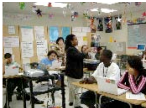
Teaching and learning is changing at Monarch High through the use of laptops.

Parents and students attended special sessions during the