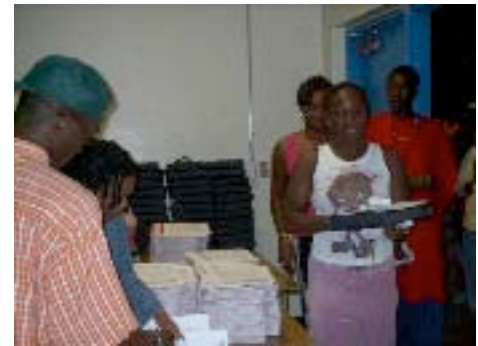
Parents & students arrive at Miramar High School for laptop checkout and training.

Students at Miramar and Monarch High and Attucks Middle Schools are now focused on learning through the use of a personal laptop. Grades 3-5 students at Broward Estates Elementary are using wireless laptop carts and primary students have been issued Leap Pads with programs that assist in reading, writing, and math skill development.