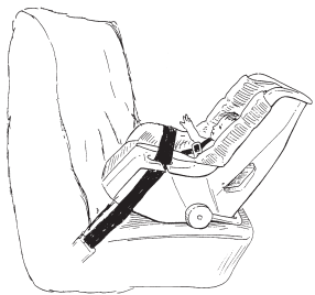
B. Rear-facing convertible seat