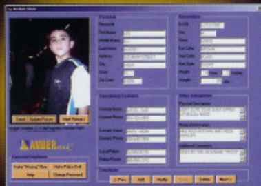
AMBER stick Software Screenshot

THE BUILT-IN AMBER stick SOFTWARE WAS DESIGNED WITH EASE OF USE IN MIND.