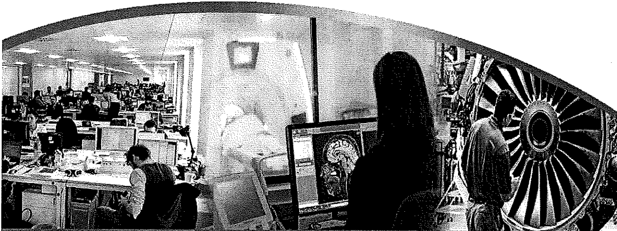
A "PARENT EXPO" ORGANIZED BY THE EDUCATION/WORKFORCE DEVELOPMENT COMMITTEE