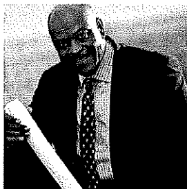
Dwight Stephenson CEO, D. Stephenson Construction, Inc. NFL Hall of Famer